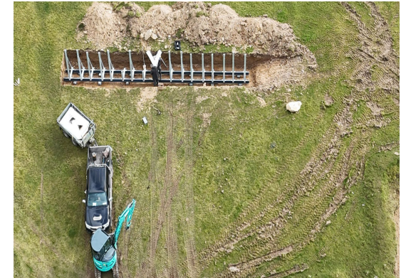
The first letter of the new Hollywood sign is erected.