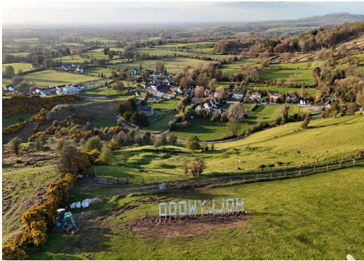
The new Hollywood sign standing proudly above the village