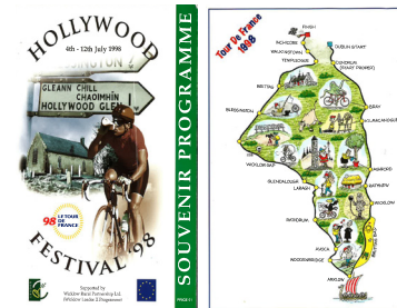
1998 brochure for Tour de France Festival, Hollywood & map showing route