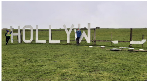
Hollywood Community Forum members inspecting the old Hollywood sign which was in disrepair.

But the sign was never designed to be permanent. Time, weather and the simple realities of its construction meant that a more enduring solution would eventually be needed.