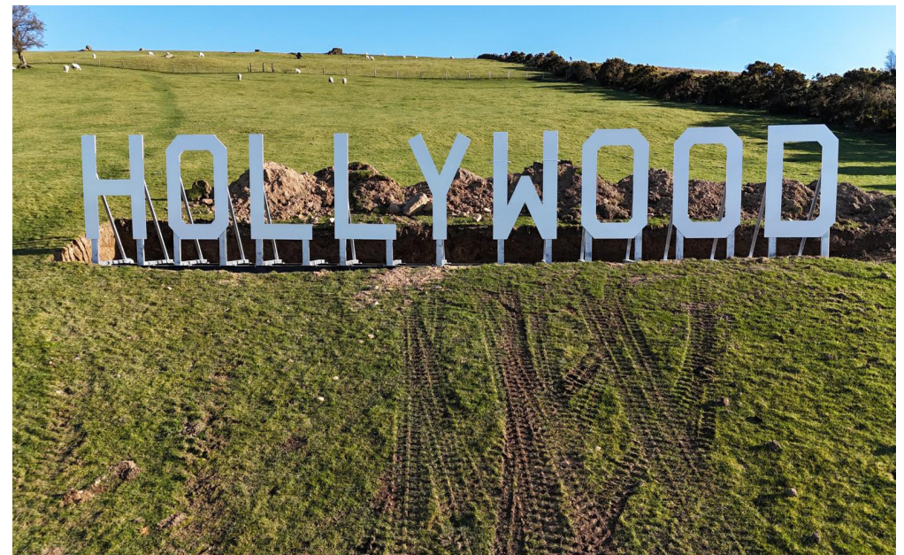
The construction of the new Hollywood sign nearing completion

Hollywood Community Forum would also like to acknowledge local County Councillors for their support for the project.