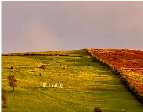
The old Hollywood sign in beautiful evening light.

Over the years, the Hollywood sign became woven into the landscape of our village. When the light shifted across the hillside, the letters seemed to disappear entirely; at other times, they caught the sun and sparkled brightly, a familiar sight that locals grew to love. 'It became part of the rhythm of the place, a quiet landmark that felt as natural as the hill itself,' said Ann Halpin.