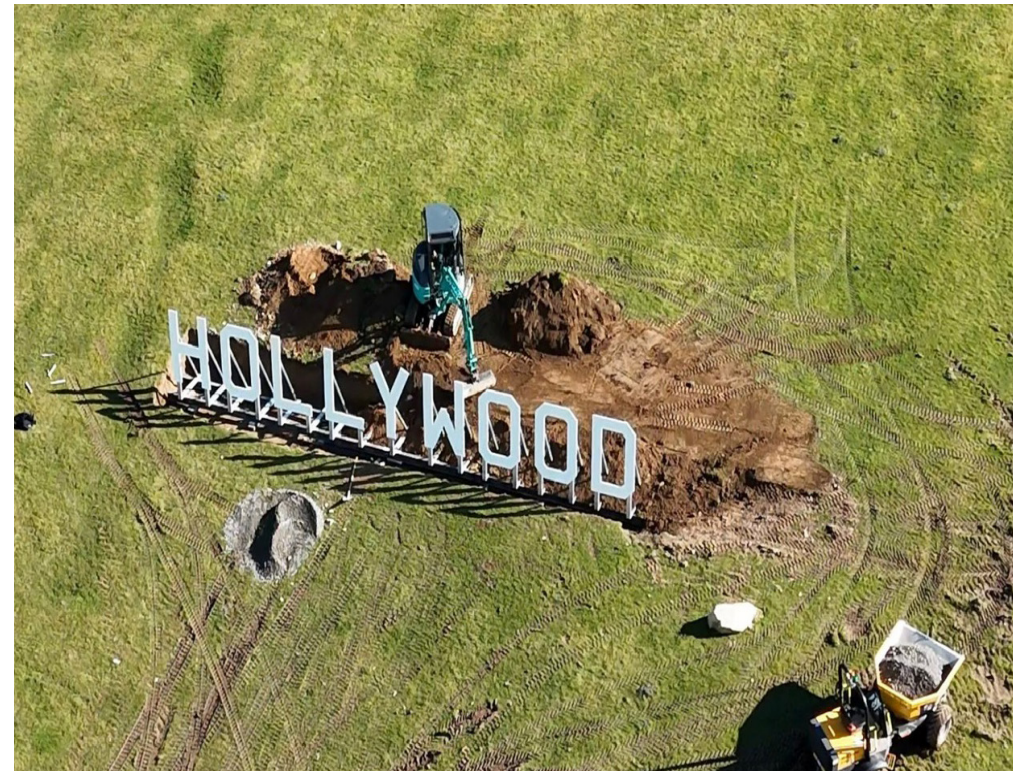
Aerial shot of the newly erected Hollywood sign

As the project entered its final months, weather challenges, design adjustments and site delivery issues all emerged in quick succession. However, through persistence, coordination and a strong sense of purpose, the project management team successfully brought the project to completion ahead of deadline, with the permanent Hollywood sign now standing proudly above the village.