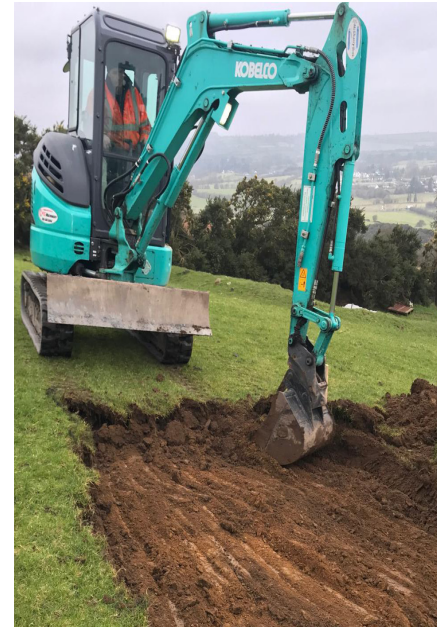
First ground is broken in the construction of the new Hollywood sign.

Hollywood Community Forum would like to acknowledge the work of our contractors in the erection of the sign and associated works.